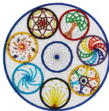
Creation Mandala

"Many things have to change, but it is we human beings who above all have to change". Pope Francis, Laudato Si' #202